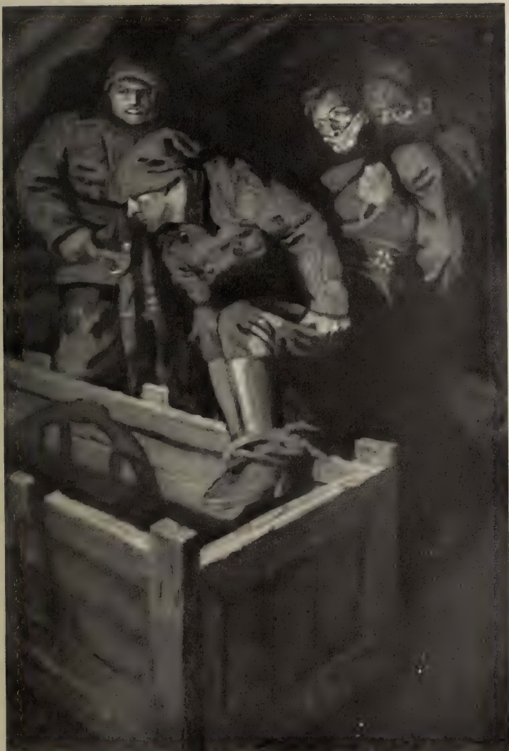
They lifted him bodily into it